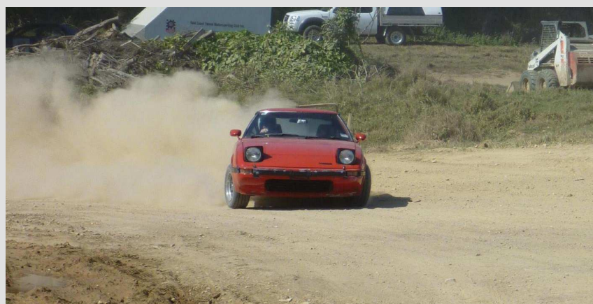
Plenty of sideways action at Tana Kita Training Day on the 08/08/2010